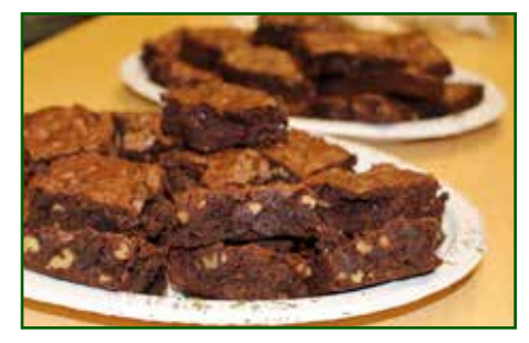
BROWNIES and gummies were available for attendees to snack on. The tasty brownies were masterfully baked by Imperial Technical Services rep Mark Pedicone.

IT'S ONE IT'S ONE INNOVATION WE WISH OUR COMPETITORS WOULD IMITATE