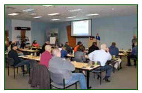
FULL HOUSE – Attendees listen attentively, eager to learn the actions they are able to take when drugs enter the workplace.